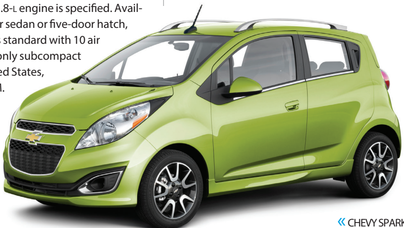
<< CHEVY SPARK

Who says your dinghy vehicle has to be small and economical? Not the Chrysler Corp., that’s for sure. This year you can recapture the American muscle car era with a snarling Dodge Challenger R/T. Towable with its six-speed manual transmission, the Challenger is powered by a 375-HP 5.7-L HEMI V-8 engine and is available in a total of seven colors. Standard features include four-wheel disc brakes with ABS, stability control, a Boston Acoustics audio system, Bluetooth connectivity, USB port with iPod control, eight-way power adjustable driver’s seat and more.