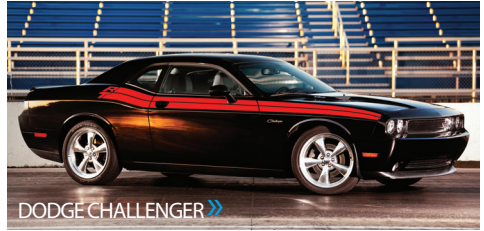
DODGE CHALLENGER >

The all-new 2012 Chevy Sonic is towable with the six-speed manual transmission, and can even be towed with the five-speed automatic when the base 1.8-L engine is specified. Available in four-door sedan or five-door hatch, the Sonic comes standard with 10 air bags and is the only subcompact built in the United States, according to GM. And after barely ringing in 2012, GM is already releasing details on the diminutive 2013 Chevy Spark, which we’re being