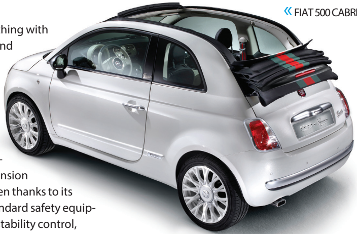
« FIAT 500 CABRIO

Now that Chrysler is under Fiat's corporate umbrella, we're starting to see the first Fiats arrive on our shores in decades. The first of these is the compact Fiat 500, which is towable with its five-speed manual transmission. Designed in Italy, built in Mexico and powered by an American-assembled 1.4-L four-cylinder engine, the Fiat 500 comes standard with seven air bags, active head restraints, electronic stability control, anti-lock brakes with electronic brake-force distribution, hill-start assist and traction control. Available in three trim grades (Pop, Sport and Lounge), the Fiat 500 offers a choice of 14 colors and creature comforts such as air conditioning, cruise control, six-speaker audio system and Fiat's BLUE&ME Handsfree Communication system, which includes voice-activated Bluetooth phone capability and a USB port with iPod control. A sunroof, leather and navigation are among the many available options. If you prefer open air motoring, consider the Fiat 500 Cabrio, which offers the same features plus a